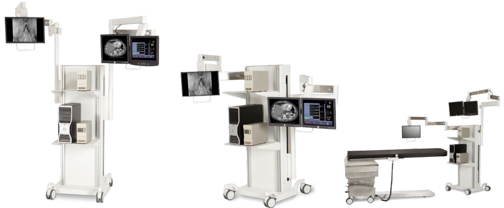
Monitors shown in vertically extended and compact positions

310 Authority Drive Fitchburg, MA, 01420 USA Toll free: 877-304-5434 Tel: 978-829-0009 Fax: 978-829-0027 www.imagediagnostics.com