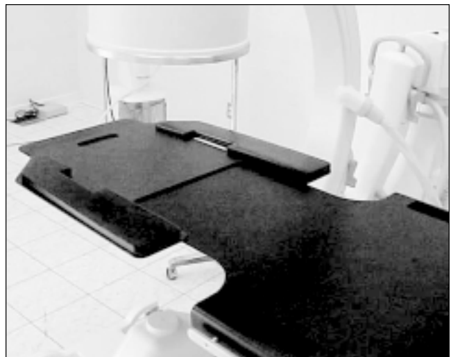
ID410 Receiver / Extender

All Aspect series tables and accessories are backed by a three year warranty on parts. Image Diagnostics, Inc. reserves the right to update product specifications, without notification, as required. www.imagediagnostics.com