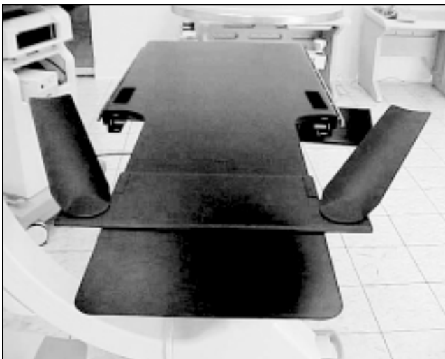
ID400 Arm Board System